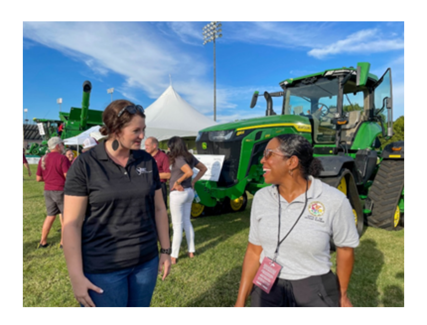
Lt. Governor Stratton meeting with locals and celebrating AgDay at Southern Illinois University – photo taken September 2021.