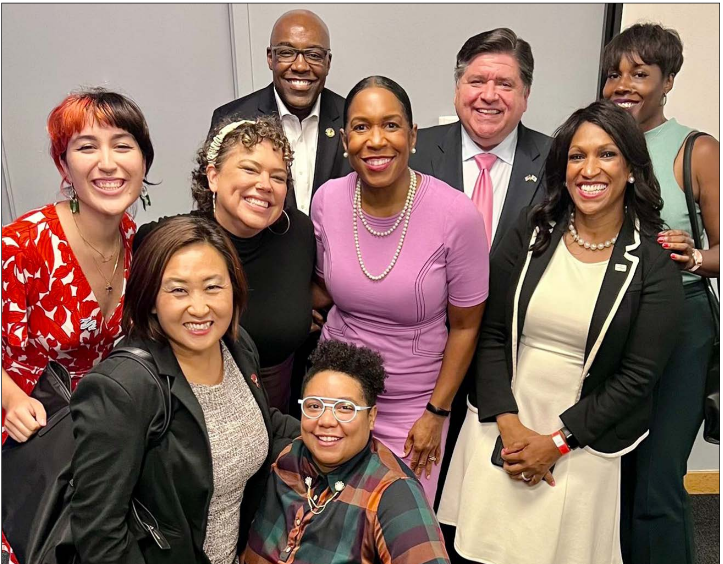
Lt. Governor Stratton (center) joins Attorney General Kwame Raoul (center left), Governor JB Pritzker (center right), and advocates and reproductive health providers at a roundtable focused on abortion rights and access hosted by Vice President Kamala Harris – photo taken September 2022.

The Illinois Council on Women and Girls is made up of appointed and ex-officio members who contributed their time, talent, and ideas to the work of the Council and this report. The Council is extremely grateful to the governmental bodies, non-profit organizations, and companies that gave their time to support the Illinois Council on Women and Girls. The Office of Lieutenant Governor Stratton served in an administrative capacity to support all works of the Council.