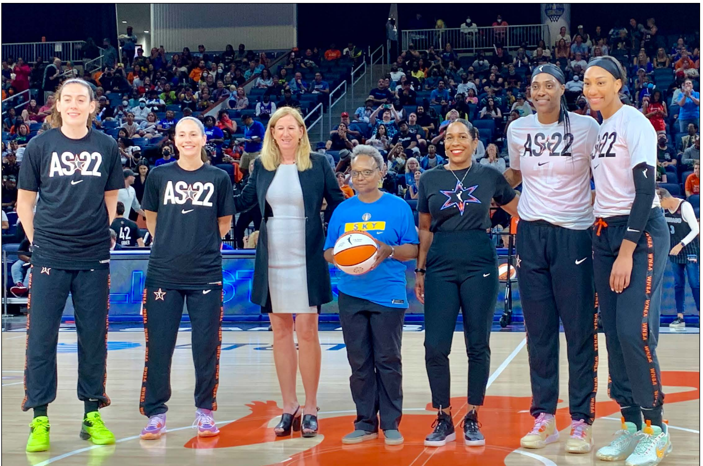
From left, Team Stewart Captain Breanna Stewart and Co-Captain Sue Bird, WNBA Commissioner Cathy Engelbert, Chicago Mayor Lori Lightfoot, Lt. Governor Stratton, and Team Wilson Co-Captain Sylvia Fowles and Captain Aja Wilson at the 2022 WNBA All Star Game – photo taken July 2022.

the IDPH Health Equity Task Force Data Committee meetings to join forces in vitally important health equity work. Notably, members of the Council's Girls Committee were engaged in the process and discussions. On July 4th, 2022, the Illinois suburb of Highland Park was rocked with a devastating mass shooting. Since then, this committee has taken up the call to discuss strategies to curb firearm violence. A formal statement (to be released in 2023) calling for laws and initiatives to prevent violence due to firearms is underway. In addition, the committee will host a two-part webinar series, during National Gun Violence Awareness month (2023), with a focus on firearm safety and support for victims and their families.