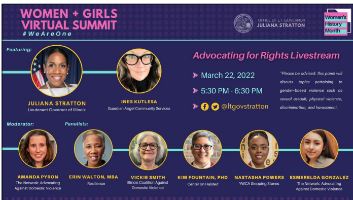
The first installment of the “Know Your Rights” campaign’s virtual series held during Women’s History Month in 2022.