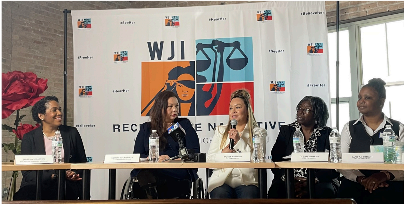
Lieutenant Governor Juliana Stratton and U.S. Senator Tammy Duckworth participate in a panel with women sharing their personal lived experience with the criminal justice system for the Chicago Incarcerated People's Communication Services (IPCS) Listening Session at the Women's Justice Institute.

Women in Justice: Team JEO will intentionally uplift the voices of women who have been impacted by the criminal legal system, whether it be through personal lived experience, the incarceration of a loved one, or through advocacy. It is important to consider the residual effects these processes have on women, and how we can include them in conversations that relate to the system's impending transformation throughout the state.