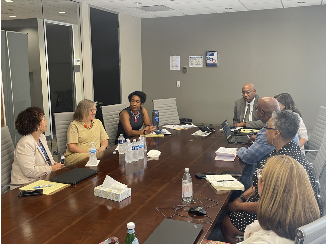
Lieutenant Governor Stratton meets with the Illinois Housing Development Authority to discuss advancing the Reentry Housing Pilot Program.

State ID Program: JEO Initiative will continue to work in partnership with First Lady MK Pritzker's Office, the Secretary of State, and the Illinois Department of Corrections to identify and address gaps to ensure the continuity of this reentry program.