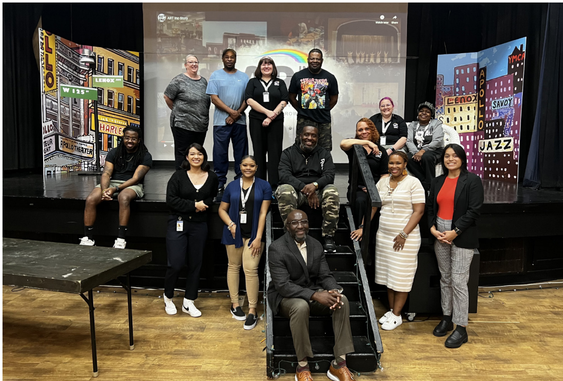
JEO Team visit the ART, Inc site in Peoria prior to the last quarterly R3 Program Board meeting of 2023.

Based on conversations with grassroots organizations interested in applying for state grant funding, there is a high need for informative presentations on how to access training, as well as resources from ICJIA and the R3 Program website. The JEO Initiative will host 12 community conversations relating to statewide funding opportunities at various second-round R3 grantee sites. The events would be in partnership with leadership from the Illinois General Assembly based on the funding region and site proximity. Hosting the convening at an R3 grantee site would allow for relationship-building and networking between potential applicants, collaboratives, previous R3 grantees, and government offices. The following list of R3 Program funding regions would serve as the areas to host the 12 community conversations: Cook – Chicago Southern, Cook – Chicago Western, Cook – Chicago Northern, Cook – Suburban, Collar, Northwest Central, South Central, Central, Northern, Cook – Chicago Northern, Northwest, and Southern.