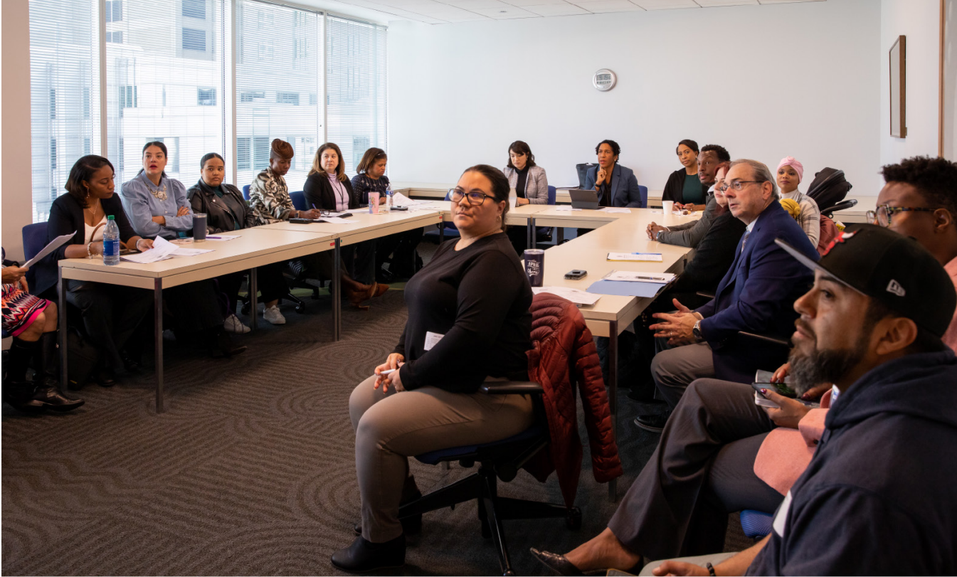
R3 Program 2023 Fourth Quarter Board Meeting.

On January 21, 2021, the Board voted to award $31.5 million in grant funding to 80 organizations and their collaborative partners. Funded programs offered evidence-based and innovative restorative practices within the R3 Program priority areas of civil legal aid, economic development, reentry, youth development, and violence prevention. On June 22, 2022, the second round of R3 Program funds provided $45 million to support 148 agencies focusing on service delivery, as well as community planning and capacity building. Since the first round's dispersal, the Board has approved both cohorts to receive different summer violence prevention funding opportunities and created sustainability for service providers to continue programming for up to three years. In total, the Board has invested more than $244 million to deliver transformational justice across communities in Illinois.