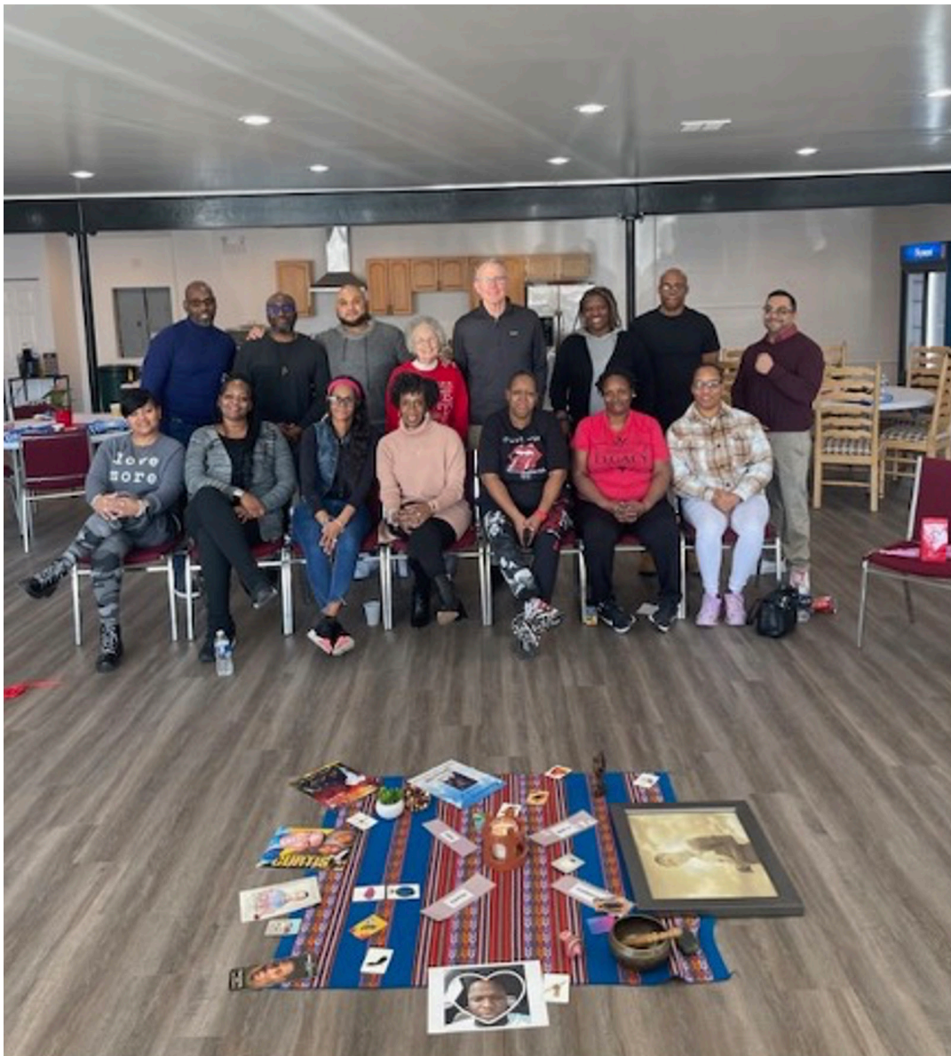
JEO Team participates in a first-of-its kind Restorative Justice Circle convening of crime survivors and men who previously caused harm.

As JEO strives to be a state-level leader in fostering healing-centered justice through the HBH program, our goal is to intentionally break systemic patterns that have historically dictated how these two groups of people interact with each other. This is a prevalent factor in unresolved trauma within disinvested communities.