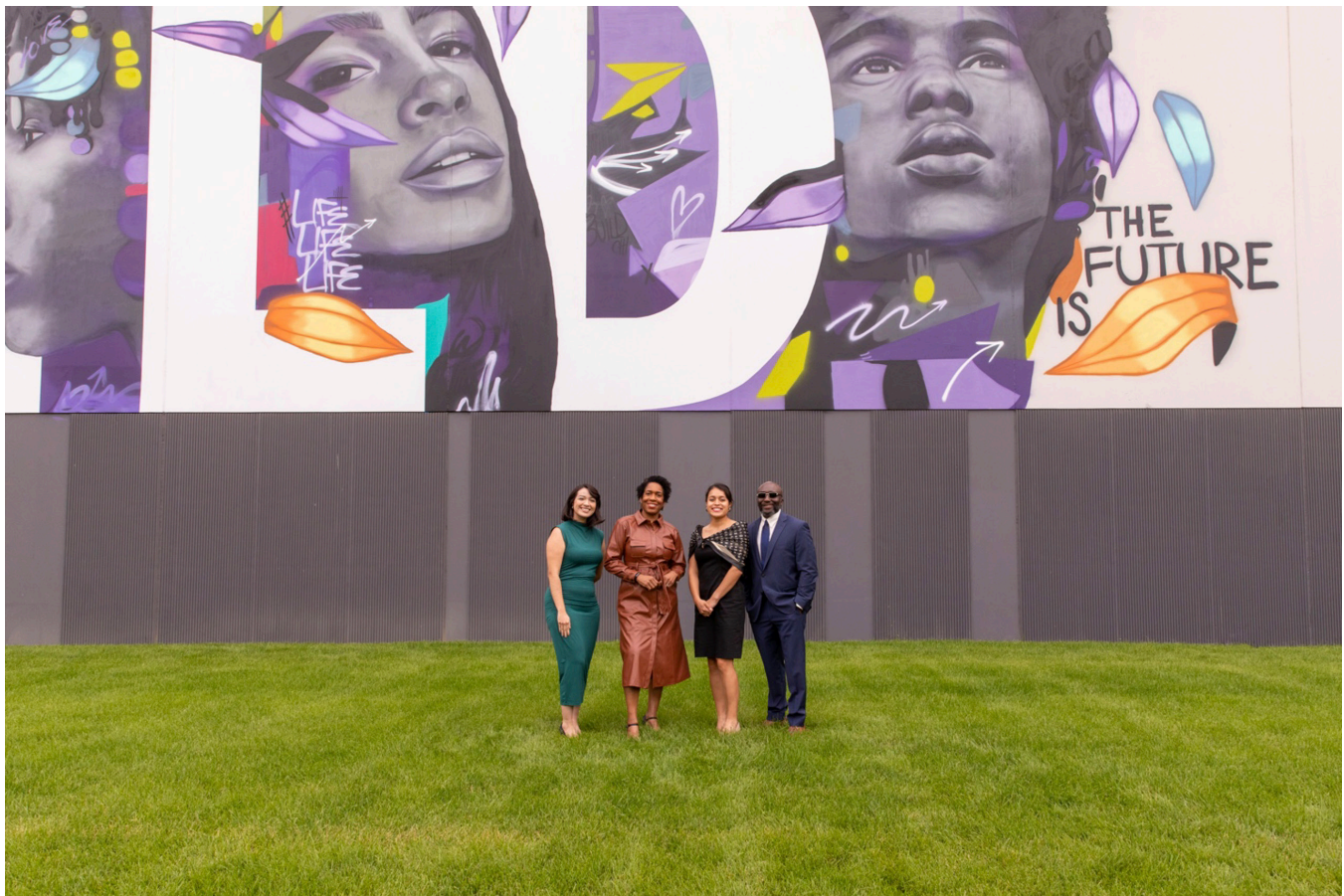
Lieutenant Governor Juliana Stratton with Team JEO at BUILD, Inc., an R3 grantee site, after the first Justice Collective Convening.

Healing Beyond Harm (HBH) – Restorative Justice Pilot: Over the next year, Healing Beyond Harm (HBH) partners aim to expand Project Transformation, Healing, and Accountability through Written Words (Project THAWW) to at least two more IDOC facilities. In achieving this goal, it will be essential to codify a notification process for crime survivors. As persons in correctional custody choose to partake in this program and take steps in repairing harm they caused, the person or party that endured the harm will receive notification of the attempt to engage in a Restorative Conference (harm dialogue).