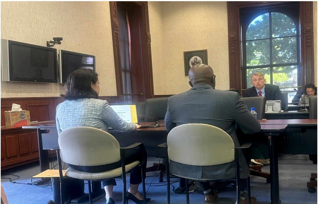
Team JEO provided expert testimony at the Illinois House of Representatives Restorative Justice Committee Hearing at the Illinois State Capitol.

In May 2023, the JEO Initiative provided subject-matter expertise to this legislative Committee about how JEO intentionally infuses some RJ principles into the application of JEO’s mission. One of the items JEO expounded on was the importance of humanizing language when talking about or referring to people who have been impacted by the criminal legal system. JEO also shared about the RJ mechanisms woven within the Healing Beyond Harm pilot to provide healing processes for crime survivors and people who caused harm. JEO intentionally serves as a bridge where gaps are most prevalent to ensure that state systems will treat historically marginalized people as human beings, which in turn helps foster the necessary healing from trauma that has systemically harmed communities throughout the state.