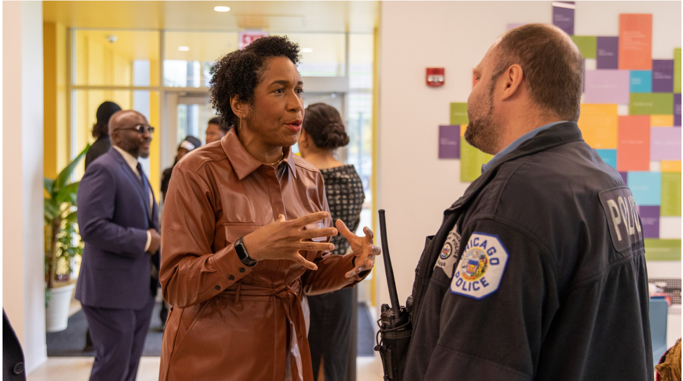
Lt. Governor Stratton in conversation with a Chicago Police officer.

Justice Collective: Community Conversations with the LG — Before Governor JB Pritzker and Lieutenant Governor Juliana Stratton took office in 2019, the transition team convened a group of approximately 50 individuals from various backgrounds to gain insight into what the administration’s justice reform priorities should be in the upcoming years. One of the group’s recommendations was the formation of the Justice, Equity, and Opportunity Initiative.