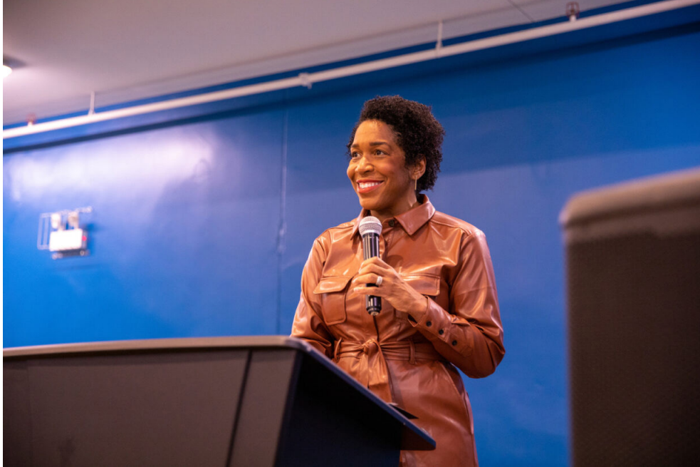
Lieutenant Governor Juliana Stratton excited to share dialogue, interact with the community, and celebrate the ongoing work at BUILD, Inc., during the first-ever Justice Collective: Community Conversations with the LG.

The Justice Collective: Community Conversations with the LG (JCCC) , was introduced to serve as a series of ongoing conversations between stakeholders and the community. In-person Justice Collective convenings will take place throughout the state to employ insightful discussion, expand awareness, and encourage the exchange of ideas for further transformation within Illinois.