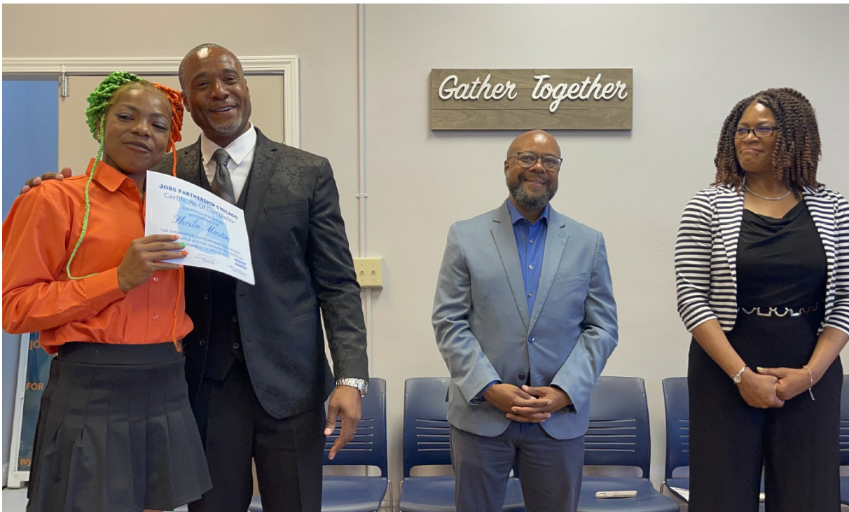
Program participant receiving a Certificate of Completion from Jobs Partnership Chicago, an R3 grantee.

On January 13, 2020, a working group of research experts from across Illinois identified areas that are eligible for R3 Program funding based on their rates of gun injuries, child poverty, unemployment, and incarceration. In their final analysis, experts examined data provided by state agencies and the U.S. Census Bureau. The eligible areas amounted to approximately 500 census tracts in Illinois. Of the eligible census tracts, 48% were designated as “high need,” indicating that these census tracts fell in the top quartile of the above indicators.