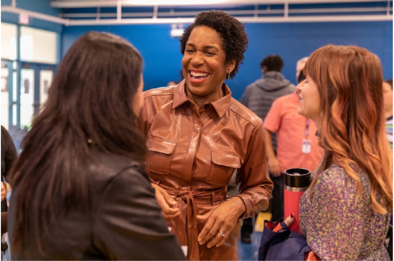
Members and advocates from the community take a moment to converse with Lieutenant Governor Stratton.

The Justice Collective convening included an array of partners consisting of representatives from advocacy organizations, service providers, government agencies, educational institutions, and other stakeholders relevant to the JEO Initiative's work.