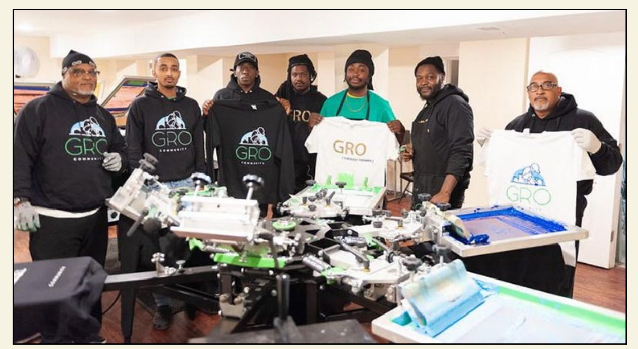
GRO Community's Adult Re-entry Clinical Workforce Development Program engages participants in half day sessions of cognitive behavioral therapy and screen-printing activities to develop employment skills.

GRO Community is a specialized mental health service provider for trauma-impacted boys and men in Black and Brown communities. This organization offers social engagement classes in anger management, violence prevention, and provides housing for participants.