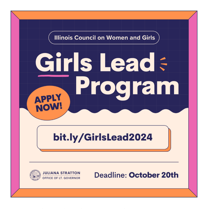
2024 Girls Lead application graphic

Throughout the year, we received feedback from girls who participated in the inaugural class of Girls Lead. One particular student expressed a desire to return with her peer research group to interview the Lieutenant Governor as part of a class project. She shared that her experience in Girls Lead inspired her to pursue a career in public service next year in college. This positive feedback prompted us to consider ways to expand the program so that more girls can benefit from similar experiences. To achieve this, we decided to broaden our mentor pool. In the first class, the participants were paired with an